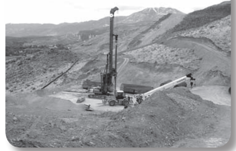
Pleasant Valley Bridge Excavation and drill rig set up for drilling concrete piles for bridge foundation. June 5, 2007

Eight piers are under construction at the Steamboat Hills Bridge site. Other bridge work along the project includes excavation for the Pleasant Valley and the Galena Forest Bridges and pouring concrete for the approaches to the Browns Creek and St. James Parkway structures. Electrical work is underway at Browns Creek Bridge and Mt. Rose Highway.