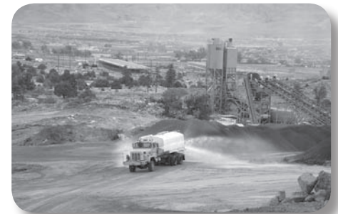
Dust Abatement Water trucks continuously wet down graded areas for dust abatement. June 5, 2007.