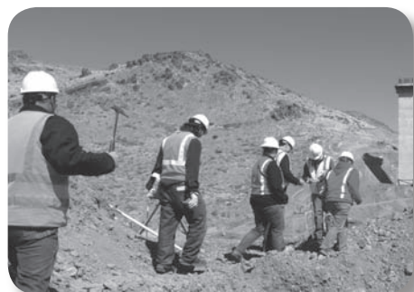
UNR Student Visit

These students are in a Capstone course for geological engineering majors. The design course requires knowledge of geology, slope stability, remote sensing, soil mechanics, groundwater, as well as other supporting classes from the general education curriculum.