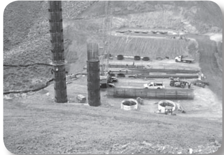
Steamboat Hills Bridge South view of pier and foundation construction at Steamboat Hills Bridge. June 5, 2007.

to recycle more than 90 percent of the material from the excavation and earthmoving activities and reuse it throughout the project. Fisher Industries has built an aggregate material production operation and on-site concrete batch plant. The aggregate production area is located at the north end of the project just south of the Mt. Rose Interchange. The operation consists of several large conveyor systems and crushers which have already produced 187,000 tons of aggregate to be used in the construction of the freeway, including aggregates for structural concrete and asphalt paving.